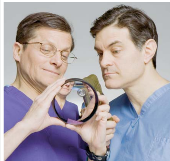
Dr. Mike Roizen and Dr. Mehmet Oz